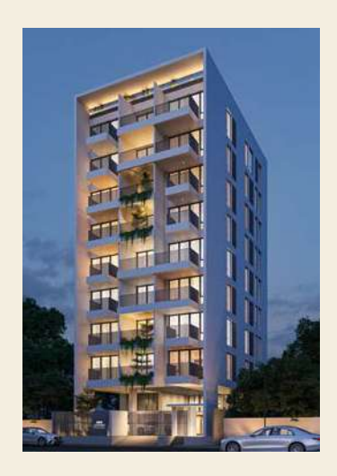
Edison Lavinia Sector 16