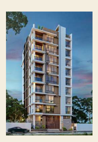
Edison Utopia Sector 12