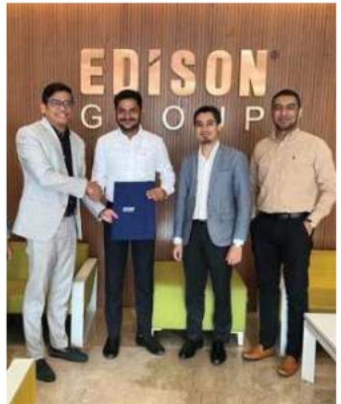
MOU signing with Health Trip

In the very first phase, this exclusive loyalty program brings together prestigious healthcare partners to offer premium services to the esteemed customers of Edison Real Estate Ltd. and the Edison Group. EREL has successfully boarded the country's first ever JCI accredited hospital, Evercare, Dhaka; the country's first-of-a-kind one-stop-shop of healthcare service, Praava Health, and Health Trip; who established themselves as world's largest health travel platform.