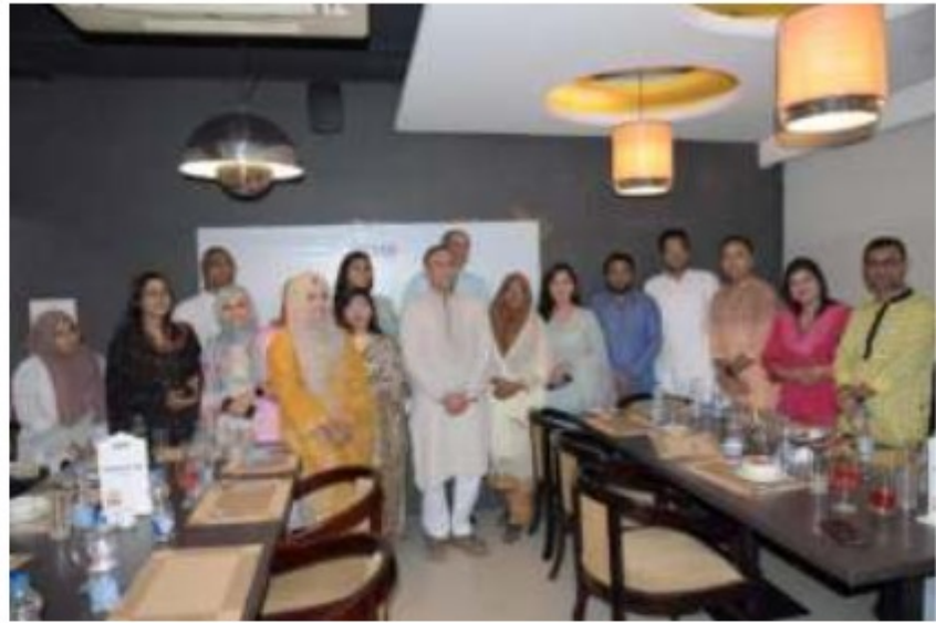
A glimpse of team iftar event

All the team members of Edison Real Estate gathered at Garlic N' Ginger restaurant of the capital on April 13, to share the joy of having an iftar together. The purpose of the event was to embrace togetherness and foster solidarity among employees.