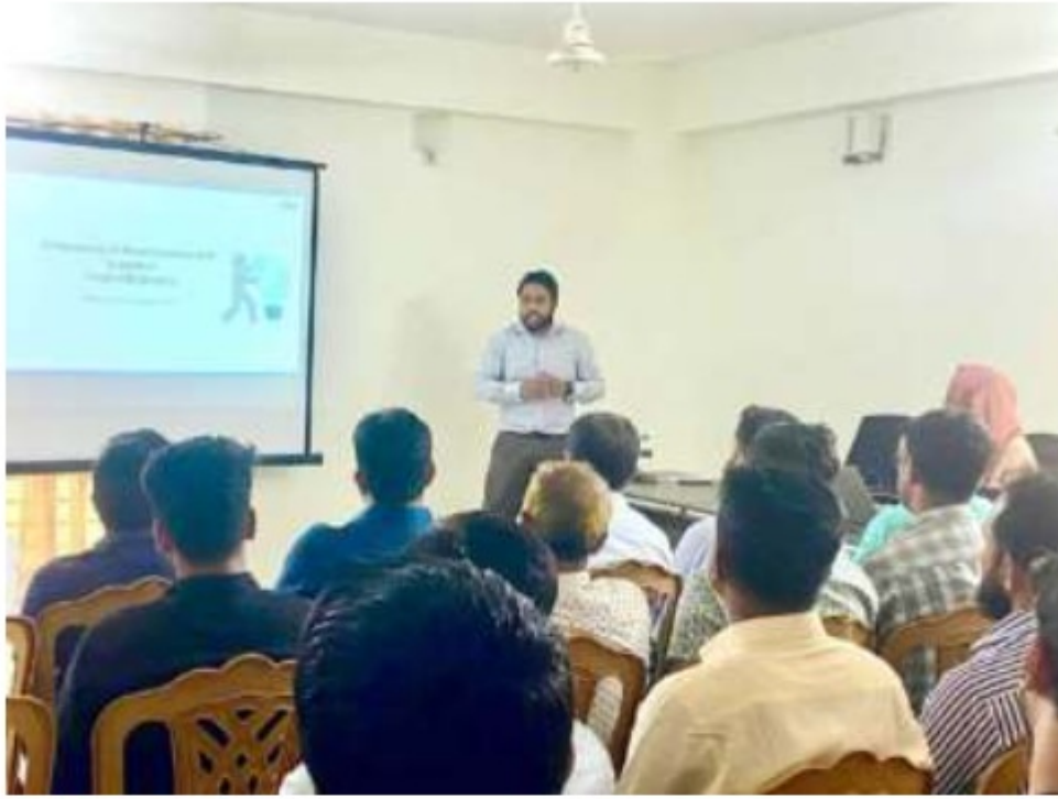
A glimpse of competency & performance assessment session