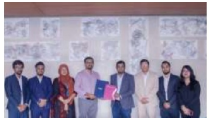
MOU signing with Praava Health