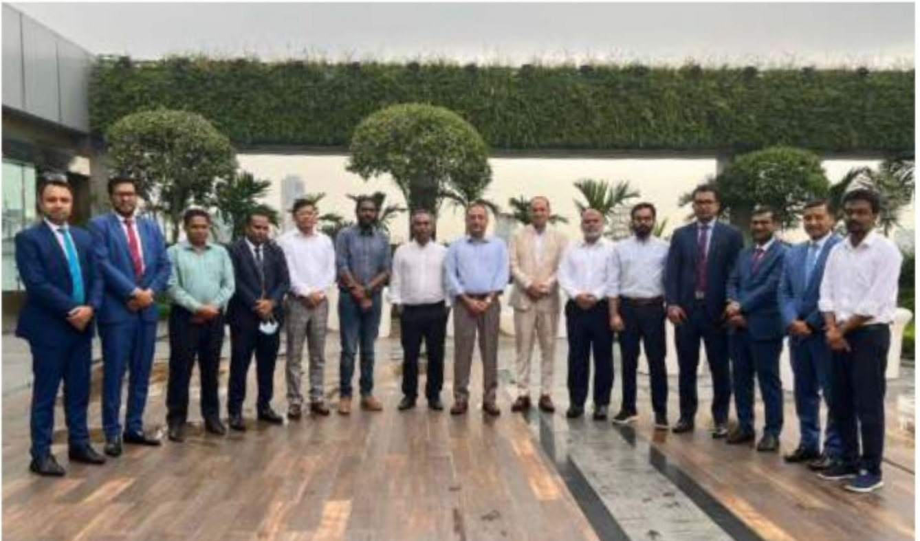
A glimpse of half-yearly business meeting of EREL

On June 18, Edison Real Estate arranged a momentous half-yearly business review meeting, a gathering that echoed with the spirit of progress and innovation. The meeting was graced by the esteemed presence of the Honorable Chairman and Senior Officials. The main purpose of the meeting was to review and discuss the yearly and long-term business strategy as well as the policy and process. The meeting has brought some fruitful decisions that will nourish both the company's short-term and long-term strategies, fostering prosperity and growth of one of the fastest-growing real estate brands in Bangladesh.