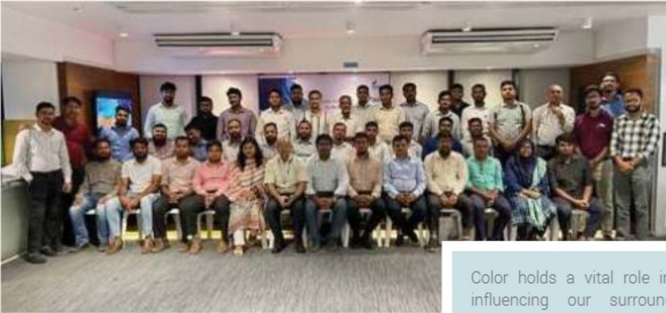
A glimpse of capability enhancement workshop participated by EREL engineers