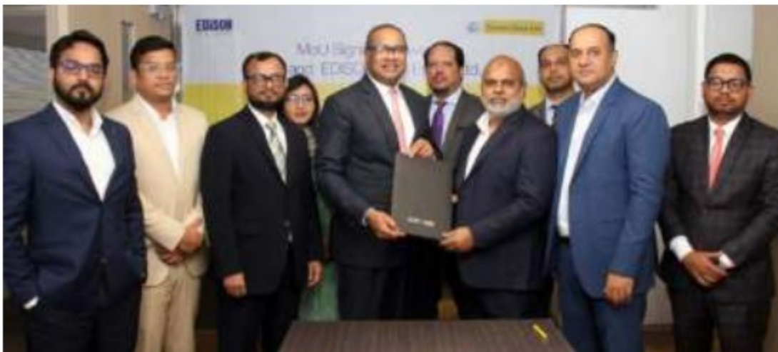
MOU signing with EBL

In a magnificent display of visionary collaboration, Edison Real Estate Limited has recently embarked on a journey of innovation, joining forces with two esteemed financial institutions. The company has signed momentous Memorandums of Understanding (MOUs) with Al-Arafah Islami Bank Limited (AIBL) in May and Eastern Bank Limited (EBL) in June, for the benefit of the partners and customers.