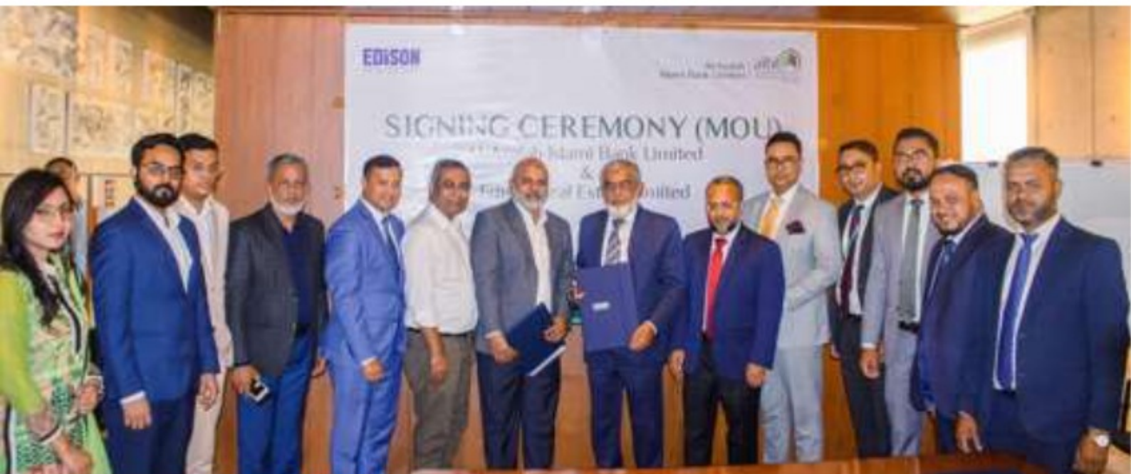
MOU signing with AIBL