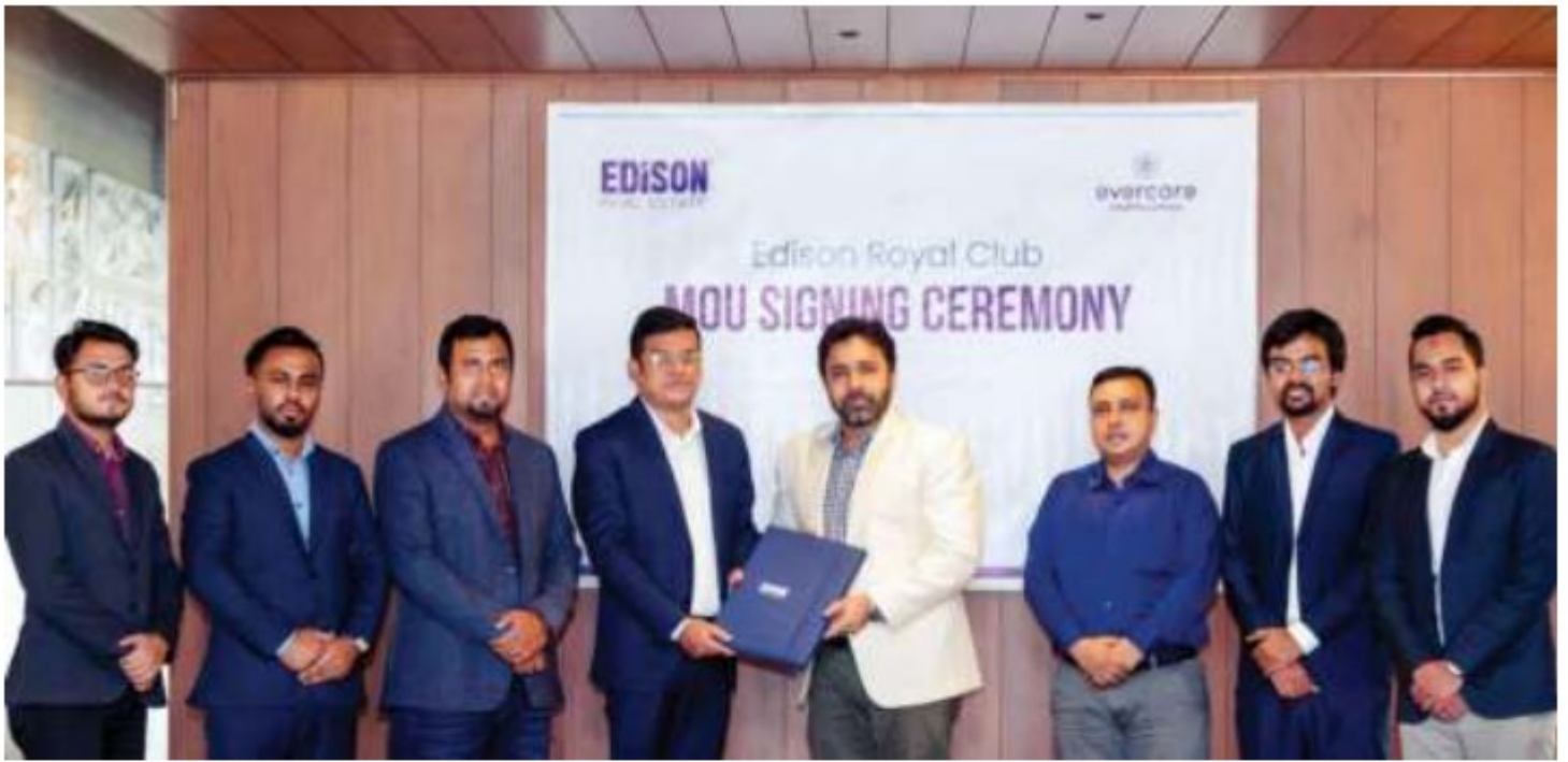
MOU signing with Evercare Hospital