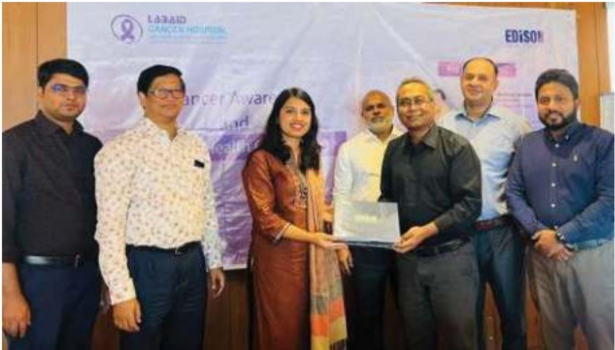
A glimpse of health & wellbeing session