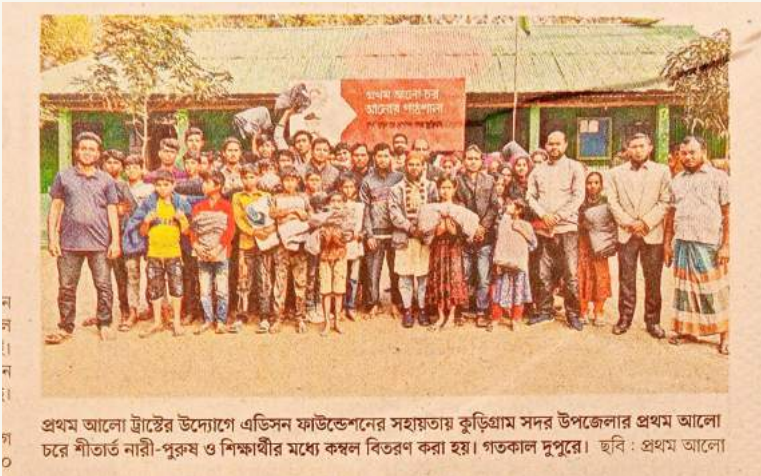
প্রথম আলো ট্রাস্টের উদ্যোগে এডিসন ফাউন্ডেশনের সহায়তায় কুড়িগ্রাম সদর উপজেলার প্রথম আলো চরে শীতাত নারী-পুরুষ ও শিক্ষার্থীর মধ্যে কম্বল বিতরণ করা হয়। গতকাল দুপুরে।

On the 4th of December, The Prothom Alo Trust collaborated with Edison Foundation and took the initiative to distribute blankets to the underprivileged. This aid has been made possible by the noteworthy contribution of Edison Foundation.